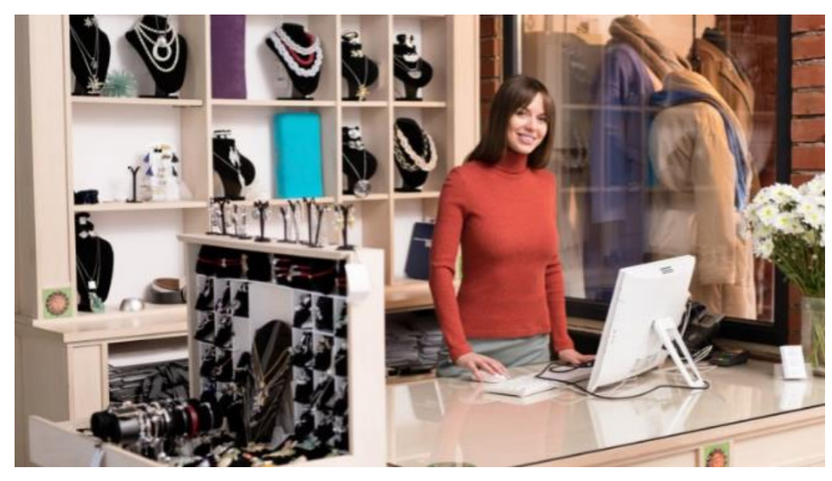
Call the Kudos Helpdesk for information on how to turn this on.

This form of Layby traditionally worked on the customer returning to your store frequently to make a payment – and often tempted into another purchase.