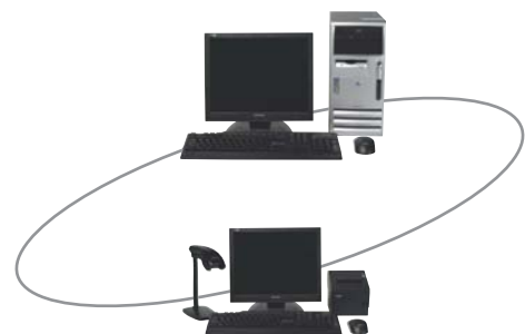
POS + Office